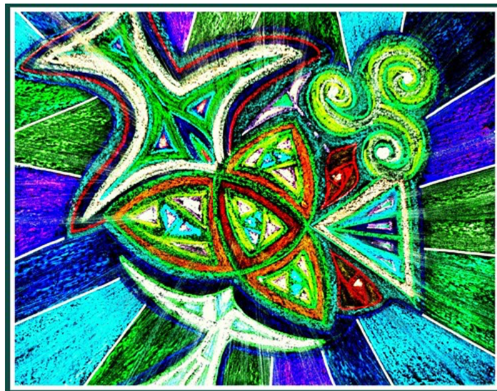
'Triune Heart of the Universe' – Stushie Art