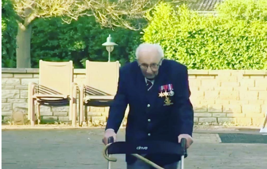
After seeing Captain Tom Moore walking 100 laps of his garden, The Department of Work and Pensions declares him fit for work.