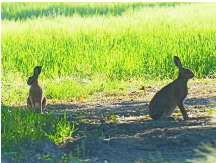
A pair of hares