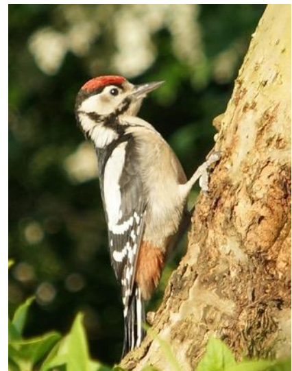
Juvenile Great Spotted Woodpecker